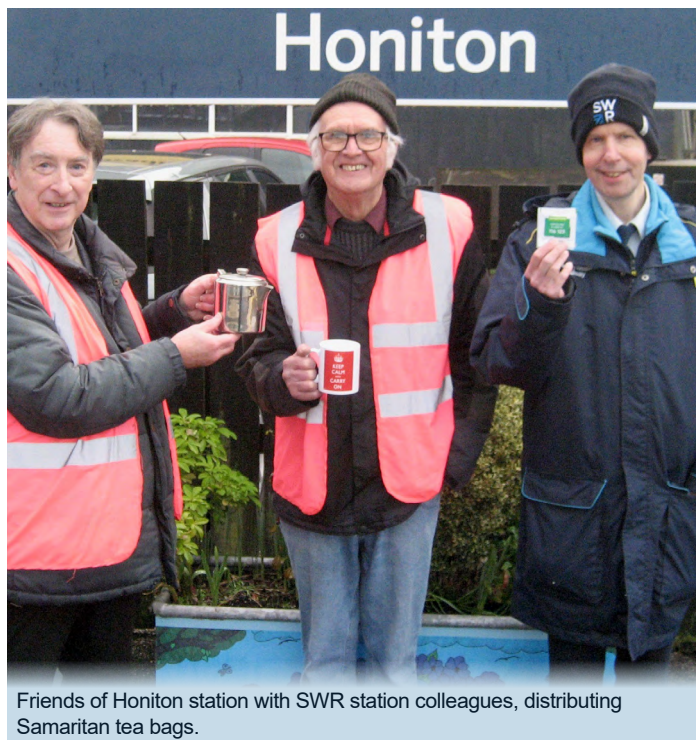
Friends of Honiton station with SWR station colleagues, distributing Samaritan tea bags.

As part of Brew Monday, volunteers from the Friends of Honiton — supported by SWR station staff — spent the day chatting with passengers, sharing information about starting conversations around mental health, and handing out Samaritans-branded tea bags to help encourage connection.