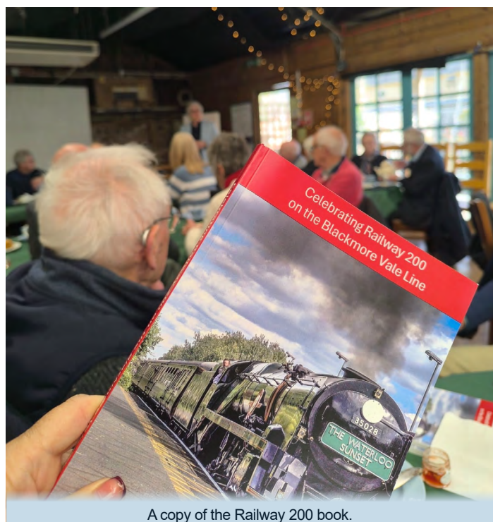
A copy of the Railway 200 book.