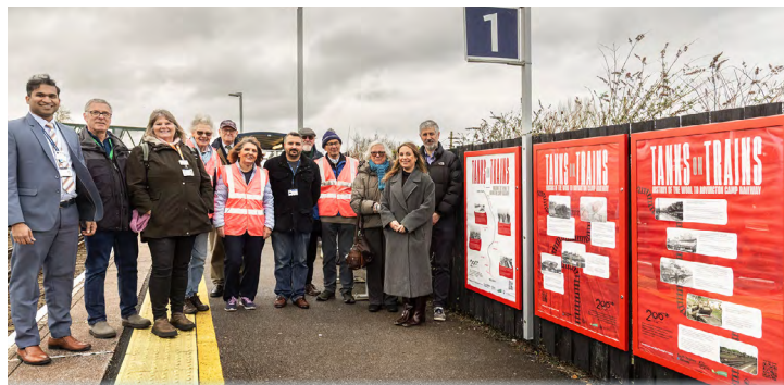
SWR, Purbeck CRP, Friends of Wool station and the Bovington Tank Museum at the launch

A new set of heritage posters has been unveiled at Wool station, created through a partnership between The Tank Museum, South Western Railway (SWR), Friends of Wool Station, and the Purbeck Community Rail Partnership. As part of the nationwide Railway 200 celebrations, these displays tell the story of Wool station's unique connection to tank development and military training.